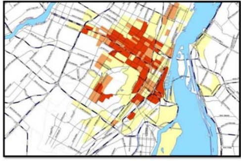
Location of Bike Stations